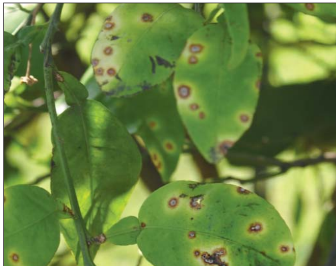
Pictured above is one of three New Orleans City Park citrus trees that tested positive for citrus canker. The trees were removed by park officials in an effort to keep the disease from spreading to other citrus trees.