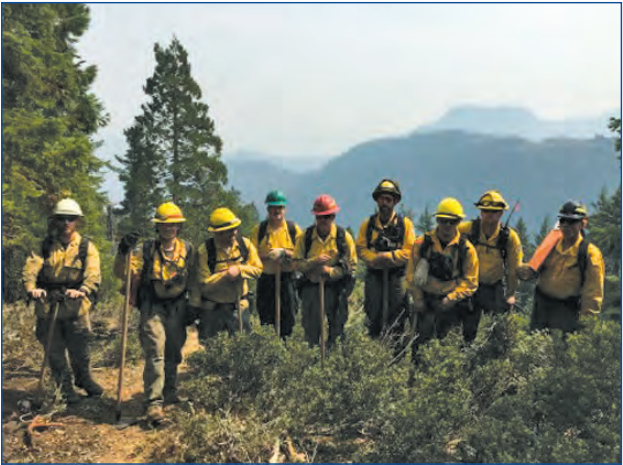
The LA# Interagency Crew assisted with Oregon wildfires during a 21-day assignment in August. The 10-person hand crew, consisted of six personnel from the LDAF and four from the U.S. Forest Service.