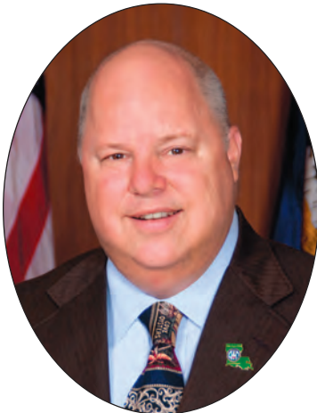
MIKE STRAIN DVM COMMISSIONER

demonstrate the capacity to reimburse farmworkers and meatpacking workers for up to $600 for expenses incurred due to the novel coronavirus 2019 (COVID-19) pandemic. The program is funded by the Consolidated Appropriations Act of 2021 and is part of USDA’s Build Back Better efforts to respond and recover from the pandemic. Additional details about the program will be announced at a later date. To read the full announcement, go to www.ldaf.state.la.us .