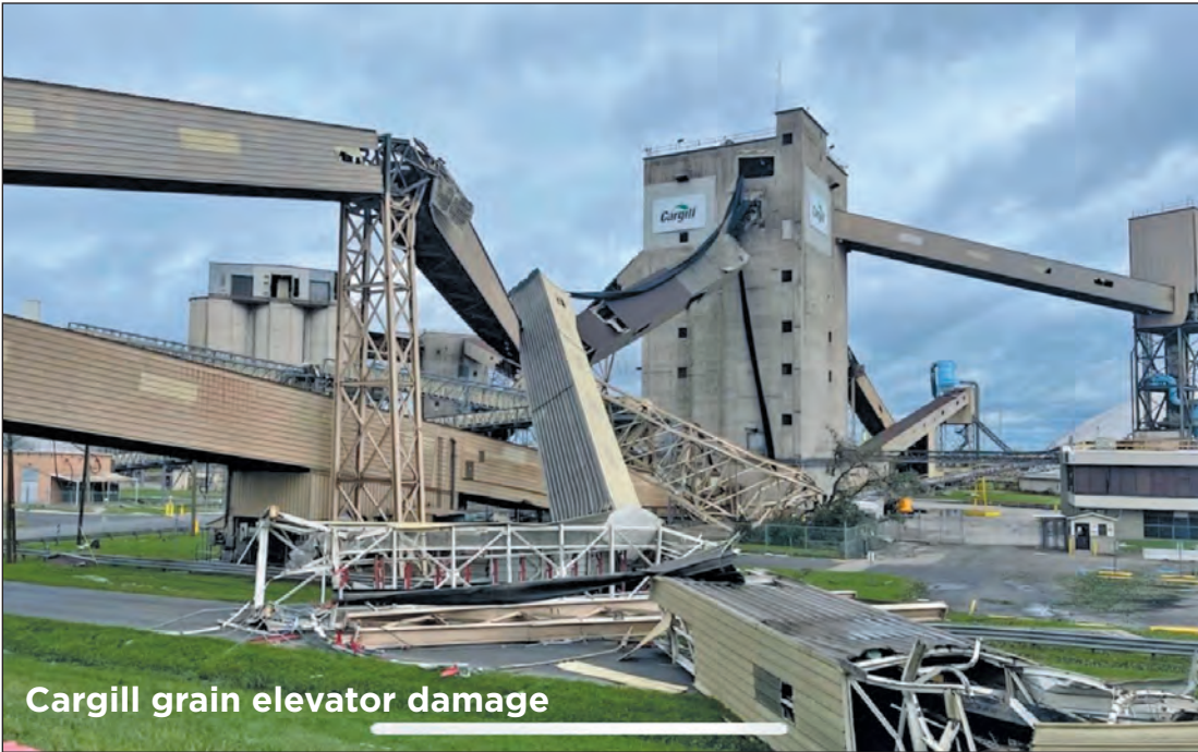
Cargill grain elevator damage