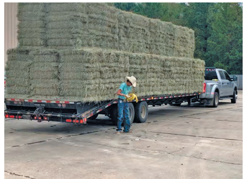
One of two trucks loads of hay delivered to Plaquemines Parish to feed cattle and horses stranded following Hurricane Ida. The LDAF and others helped make this possible. They include the Louisiana Farm Bureau Federation, Louisiana Cattlemen's Association, LSU AgCenter, Louisiana Veterinary Medical Association Equine Committee, Texas Equine Veterinary Association, Texas A&M Veterinary Emergency Team, Texas A&M Veterinary Association and The Foundation for the Horse.