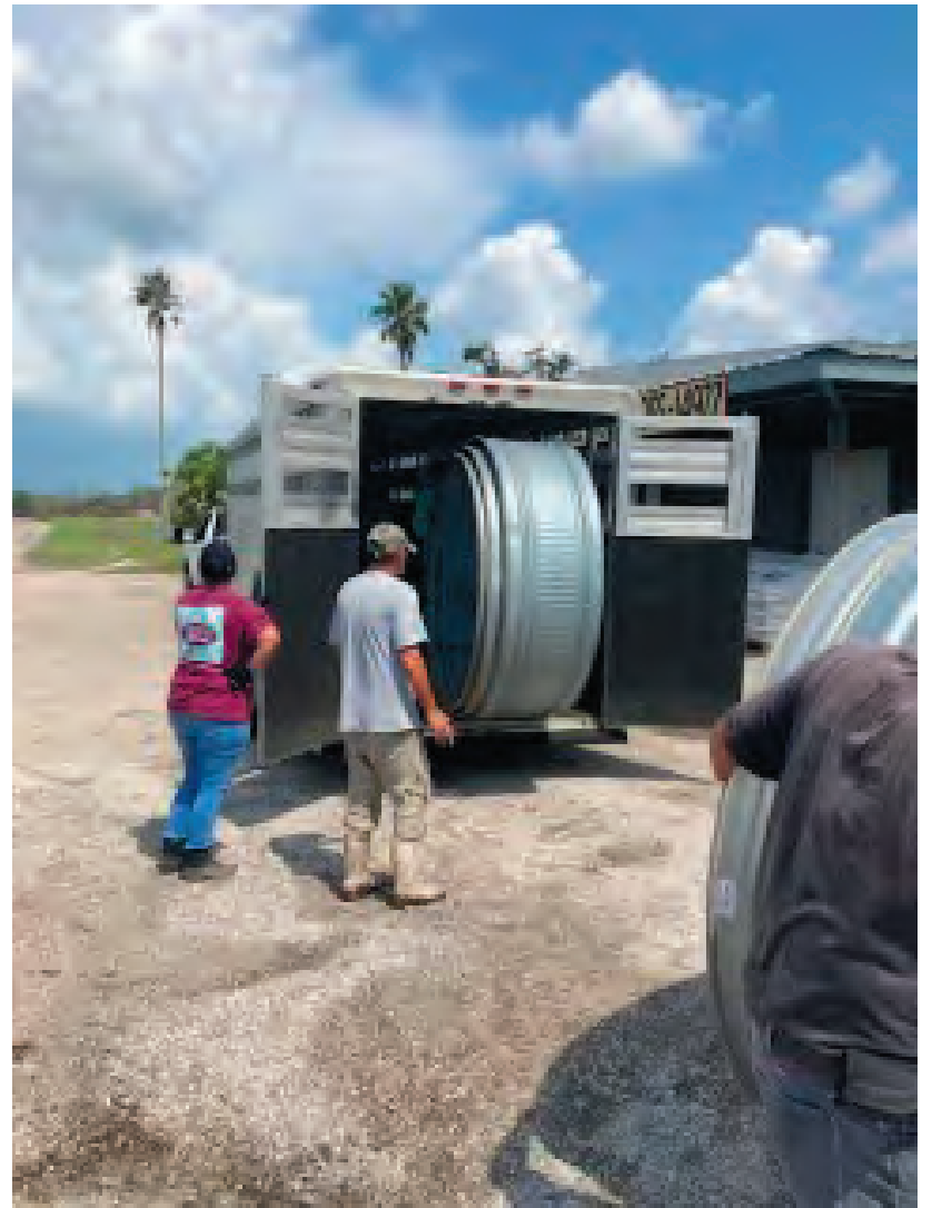
The LDAF delivered water troughs to producers hit hard by Hurricane Ida to get fresh water to cattle.