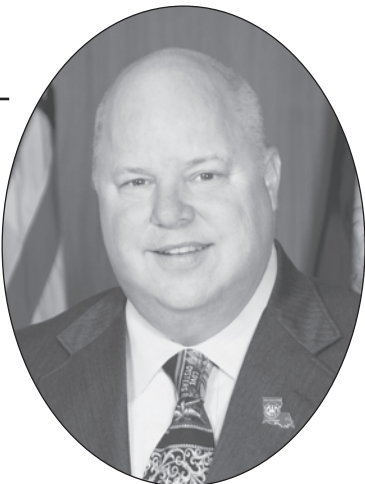
MIKE STRAIN DVM COMMISSIONER

FSA office for further information on eligibility requirements and application procedures. Additional information is also available online at https://www.fsa.usda.gov/state-offices/Louisiana/news-releases/2021/la-availability-of-low-interest-physical-loss-loans-for-producers-affected-by-natural-disasters .