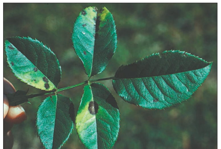
If the plants are showing signs of black spot or mildew, be sure to rinse your pruners in 10% bleach solution then in water before moving onto healthy shrubs to prevent the spreading of any disease.