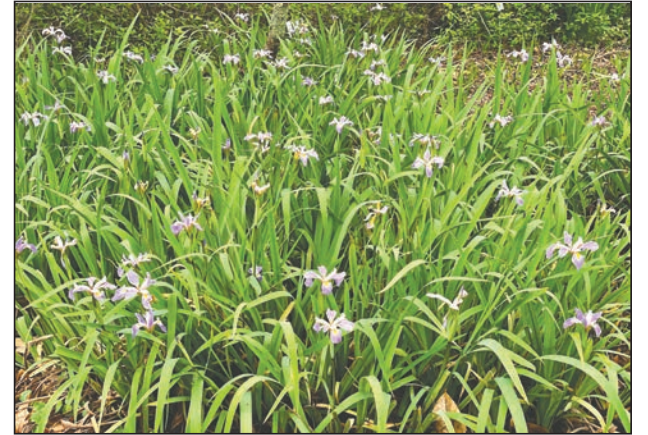
Divide overcrowded irises in late summer.

Perform maintenance in the summer vegetable garden. Remove spent summer tomatoes, peppers, eggplants, etc. that have tucked out. If your spring-planted eggplant, pepper plants and okra still look good let them continue to grow. They often produce another fall crop.