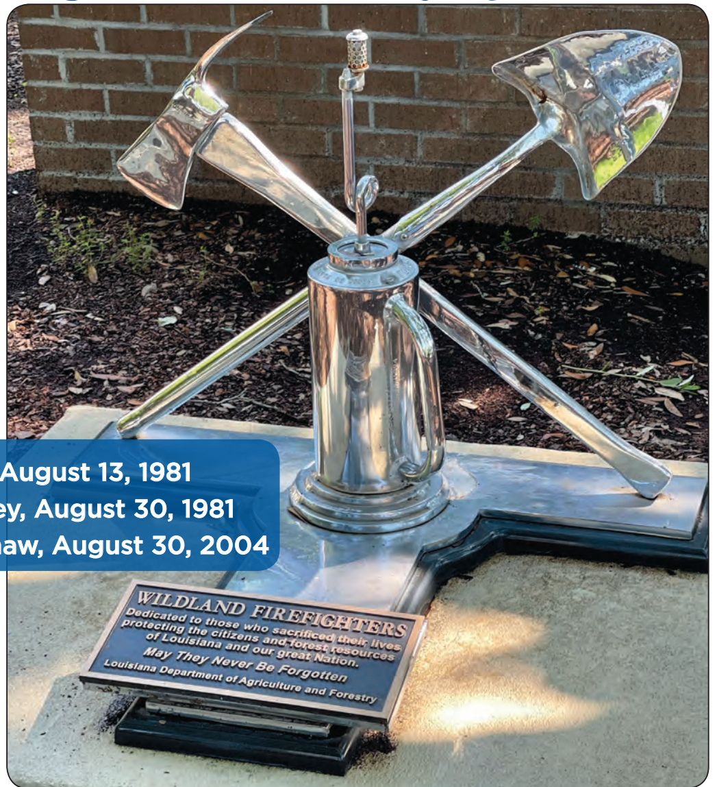
The Wildland Firefighter memorial was erected in 2014 on the grounds of the Louisiana Fallen Firefighter Memorial located at 8181 Independence Blvd. in Baton Rouge, La.