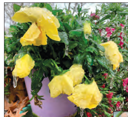
Cool-season annuals such as pansies and dianthus will likely thaw from the freeze and bloom again in the spring.

The spectrum ranges from zone 1 in Alaska to zones 12 and 13 in Hawaii and Puerto Rico. Most of