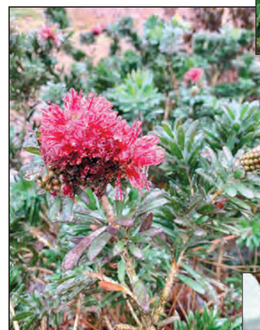
Dwarf bottlebrush is cold hardy in USDA hardiness zones 8 to 11. It will likely sustain some damage from the freeze. Photo by Bob Mirabello/LSU AgCenter

Saucer magnolia buds frozen in ice. These trees are hardy and will be OK. Photo by Bob Mirabello/LSU AgCenter