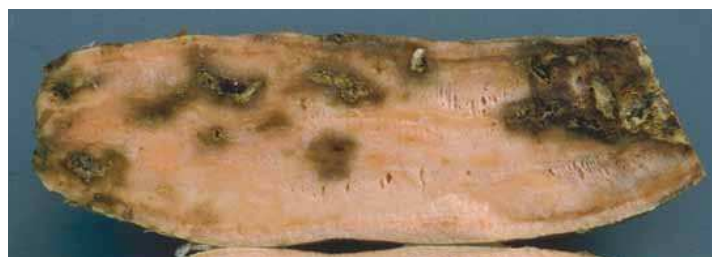
Adult feeding holes and larval damage to sweet potatoes.