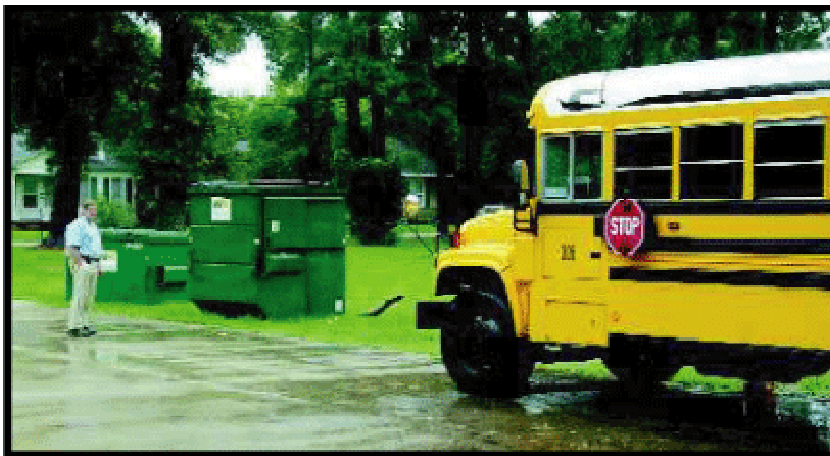
Little things like keeping trash dump bins covered and closed keep vermin and other pests away from the school grounds.

For more information, contact the Department of Agriculture and Forestry's Office of Agricultural and Environmental Sciences at 225-925-3763.