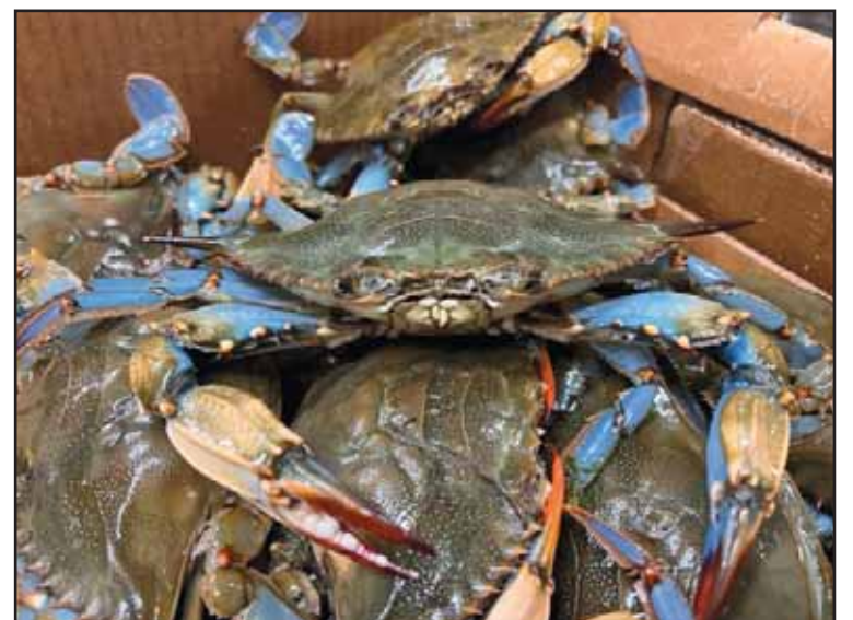
Tillman's Seafood is a Certified Louisiana company that catches, buys, and sells live blue crabs.