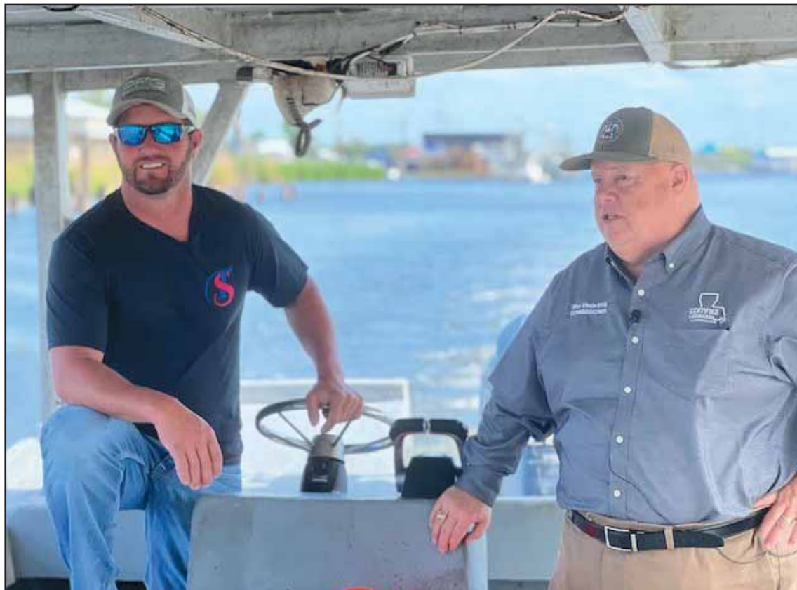
The LDAF Commissioner Mike Strain DVM visits with Tillman's Seafood in Chauvin for the latest episode of the Crawfish Tales.

The Tillmans are part of an important aspect of Louisiana's economy - aquaculture. Aquaculture is the practice of farming aquatic organisms. Aquaculture businesses breed and harvest plants and animals in water - freshwater or seawater - and prepare them for human consumption. The aquaculture industry in Louisiana includes a va-