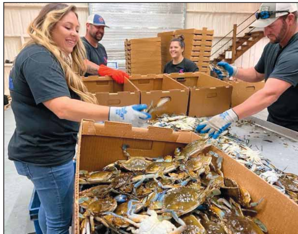
The crabs are caught, sorted, and distributed the same day ensuring consumers are getting the freshest Louisiana products.

Pride of occupation, self-reliance, and adaptation to adversity are central to the culture and heritage of Louisiana fishing families. Generations of Louisiana fishermen have weathered hurricanes that have destroyed entire coastal communities, as well as economic downturns that shuttered businesses