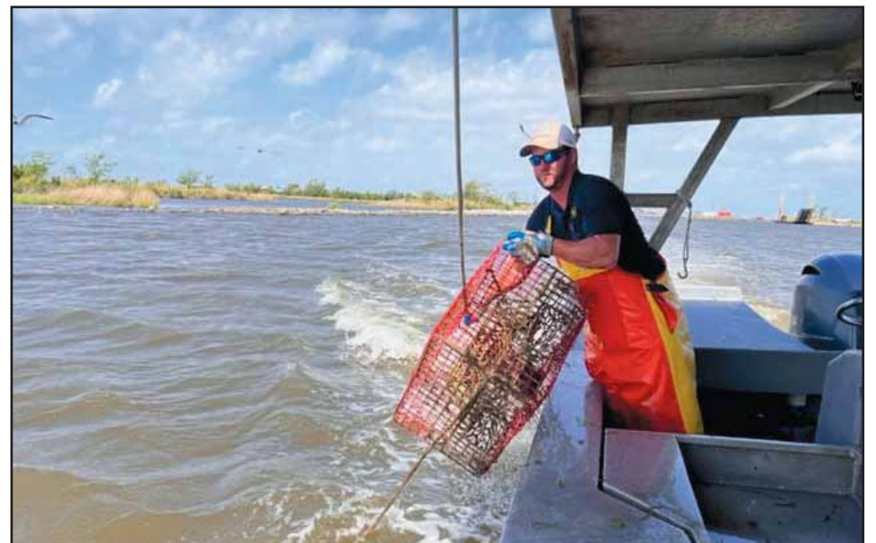
Tillman's seafood runs 1,000 of their own traps as well as buys from fishermen all along the Gulf Coast.