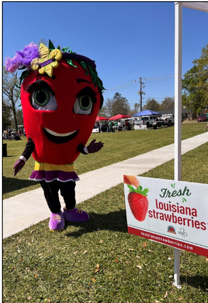
Jazzy Strawberry was out and about saying hello, taking pictures, and hugging bunnies.

Louisiana's strawberry industry dates back to the 1800s when The Great Economic Migration brought a wave of Italians and Hungarians to America with hopes of finding work. Many moved to Louisiana and began strawberry farms in the warmer weather and rich soil. By the 1920s, the industry was booming. Louisiana farmers sold their berries to