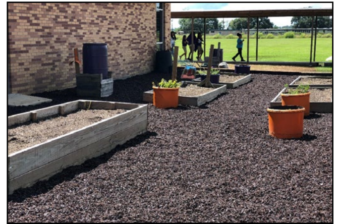
Left, Catholic Elementary of Pointe Coupee School Garden with both raised beds made of 2"x10" treated boards and recycled molasses tubs. Right, STEM Magnet Academy of Pointe Coupee School Garden utilizing both raised beds and recycled molasses tubs. Also pictured are rain barrels made of recycled plastic barrels.

because as we all know, plants do not grow without water. In the heat of the spring and summer in Louisiana, we need to water more often than you may think, especially in raised beds. Another thing to consider is irrigation for your garden, but we will have to save this for a later article as this is something that can get lengthy.