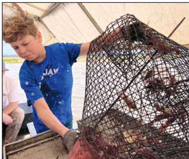
A group of young boys celebrated a friend's birthday at Crawfish Haven recently where they got to help run the traps and pick the lucky crawfish, Arrigeaux.

and more than 7,000 local Louisianians make a living working in the crawfish industry.