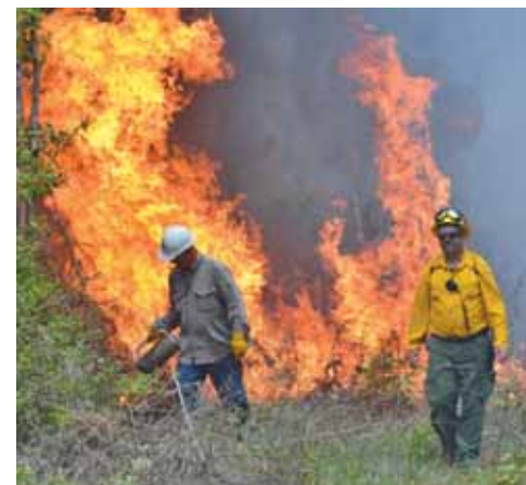
Flames rise over the heads of student of the Louisiana Department of Agriculture and Forestry, during a past workshop to teach techniques used in a controlled burn.

For more information on additional eligibility requirements and the application forms, visit https://www.ldaf.state.la.us/forestry/protection/forestry-protection-programs/ . The deadline to apply is July 1, 2022.