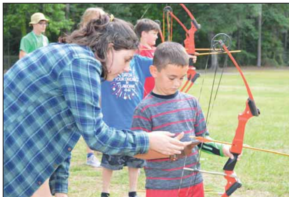
from 4-H camp

4-H Camp at Camp Grant Walker is celebrating 100 years in 2022, the past two of which have been difficult. The facility has been shuttered because of the COVID-19