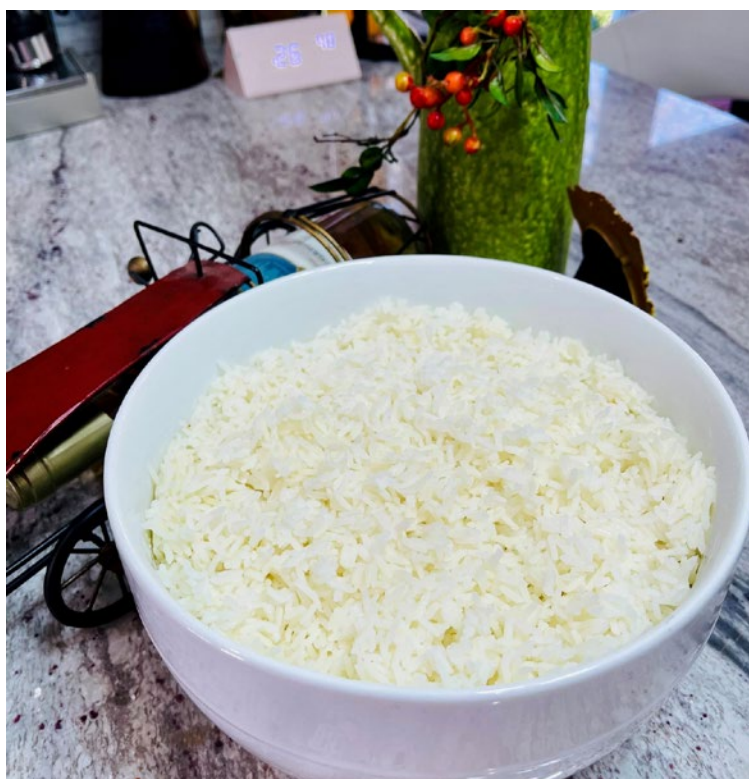
Cooked low glycemic white rice.

Diabetes is a worldwide problem affecting more than 463 million people (9.3% of world population). In the United States alone, more than 34.2 million people have diabetes (10.5% of the U.S. population), and 88 million people aged 18 years or older have prediabetes (34.5% of the adult U.S. population). Worldwide, diabetes prevalence is estimated to rise to 10.2% (578 million) by 2030 and 10.9% (700 million) by 2045. Diabetes is among the top 10 causes of death in adults and has caused 4.2 million deaths