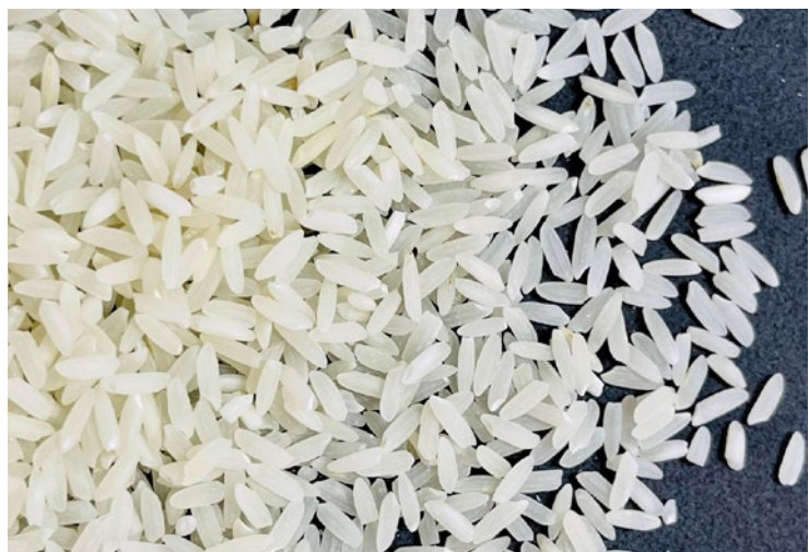
Cooked low glycemic white rice.

glycemic index ever reported in commercially viable rice.