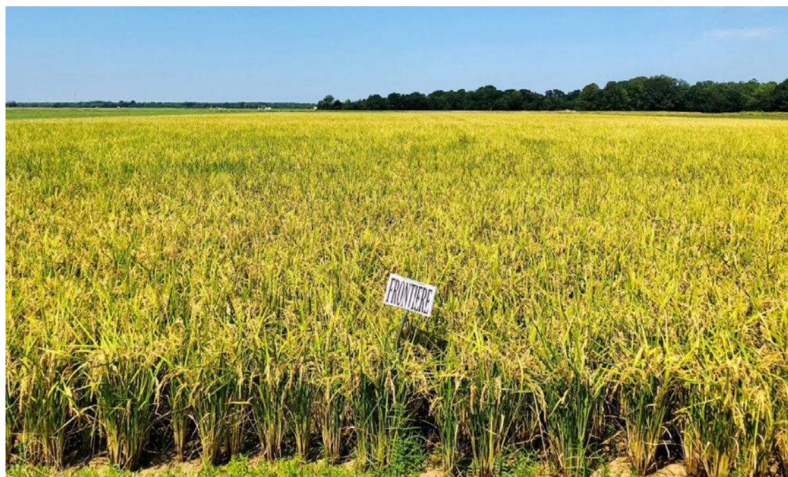
Foundation seed of low glycemic Frontière rice at the H. Rouse Caffey Rice Research Station, Crowley, Louisiana.

There are three groups of glycemic ratings for food — low with a glycemic index of 55 or less, medium with a glycemic index of 56-69, and high with a glycemic index of 70 or more. In general, high carbohydrate food, such as wheat, has an average glycemic index of 74; potato, 78; and corn, 55. Rice has an average glycemic index of 73 and, therefore, is categorized as a high glycemic food source. The newly invented low glycemic rice has an average rating of 41, which is 14 points lower than the upper margin to be classified in a low glycemic group. It has the lowest See RICE, page 23