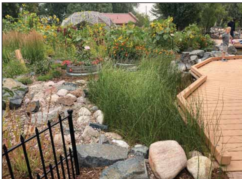
Botanical gardens spread across the United States make great destinations when planning travel.

To begin with, many of us think about losing weight, or at least eating healthier, this time of year. Most people tend to increase the