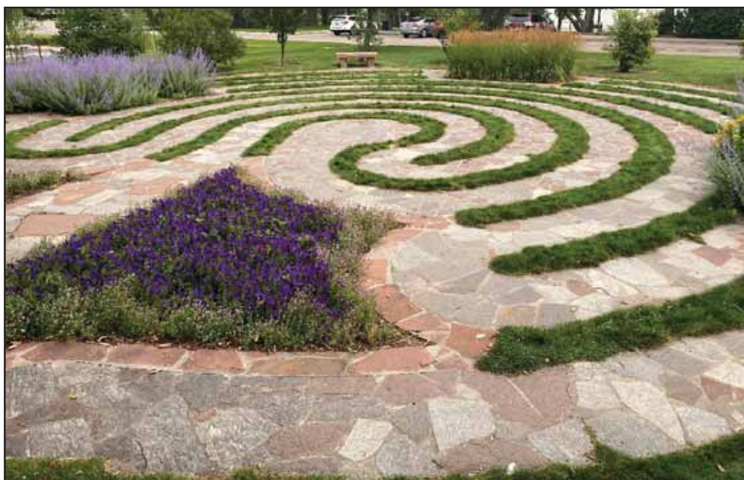
Find stress relief and relaxation by visiting botanical gardens found across the United States.

If engaging more in exercise and increasing your physical fitness is your goal, the garden is a great place to get in a good workout. Gardening activities are well suited to meet recommendations for daily exercise. See Resolutions, page 20