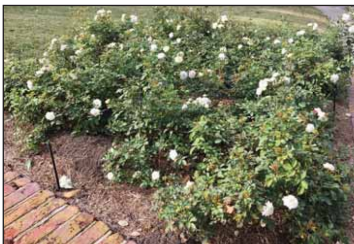
Evergreen drift roses are an excellent choice for dwarf evergreen blooming foundation plants.

house, while smaller ones should be planted at least 3 to 4 feet away. Another important tip is to keep mulch, especially wood mulches, 1 foot away from the foundation of the home to help prevent termite infestations. Fill that area with rock or crushed granite for a tidy look.