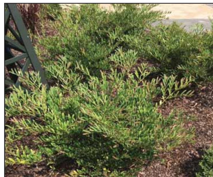
Gorgeous and compact, the Cinnamon Girl variety of dwarf distylium is a great shrub to consider adding to your landscape.

If you love flowers, consider the bloom time of each