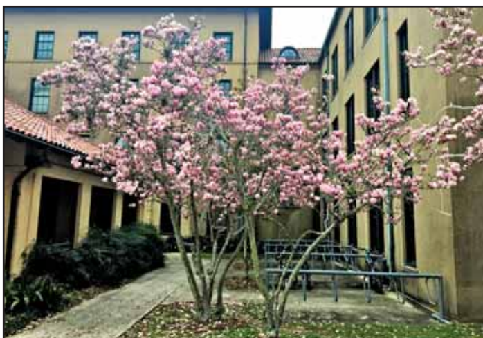
Japanese magnolias are excellent accent specimens or small trees for use as foundation plantings.