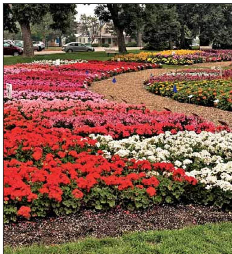
Garden plant trials are held throughout the year at many universities such as the one here in Fort Collins, Colorado. Plan travel around trials.

Gardening can be your one-stop shop for meeting your New Year's resolutions this year. Get out there and get it growing!