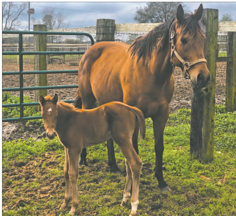
Yankees Little Darling with her two-day old foal (filly).