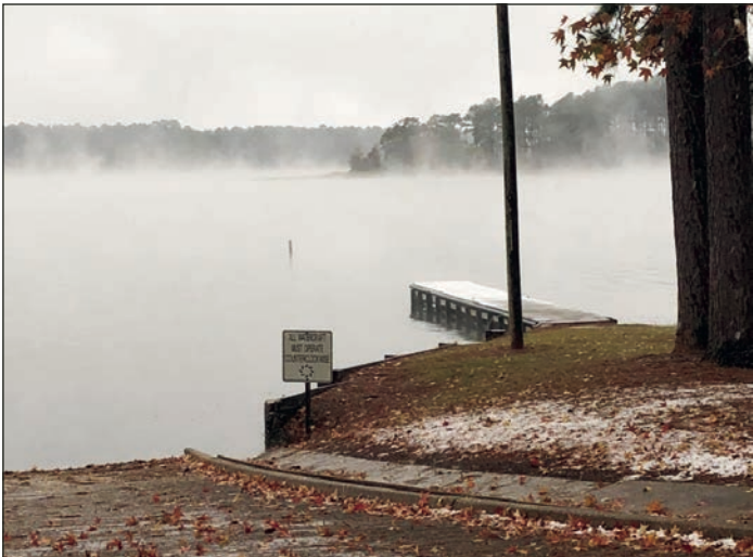
Indian Creek Recreation Area, located in Woodworth, Rapides Parish, was covered in a blanket of powdery, white, snow on Dec. 8, 2017. Indian Creek entrance (left), boat launch (top), snow covered trees.