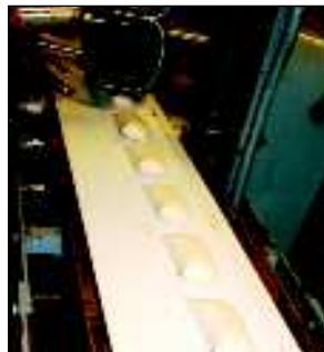
Hubig's turnover pies head for the glazing process.

Bywater streets accommodated the first wave of 20th century German and Irish immigrants.